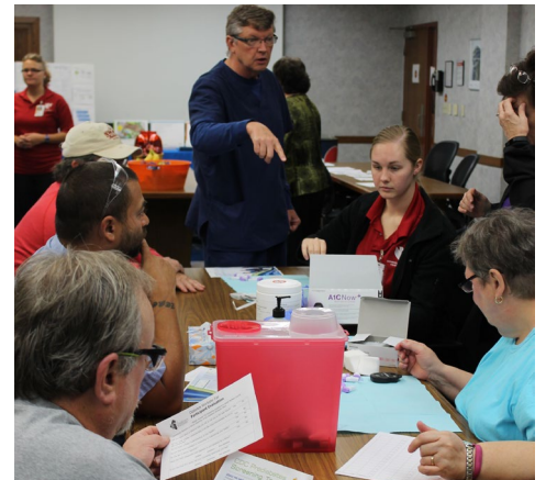
UNMC students and DRN volunteers assist in screening Eaton employees for diabetes and pre-diabetes on November 2nd at Eaton.