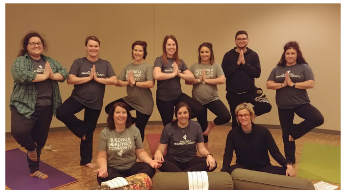
Community Partners staff do yoga at Just Breathe Yoga.

The afternoon was spent "practicing what we preach" as we ate lunch and attended a yoga class together. Twice yearly retreats allow staff to unplug from the work they do daily and reconnect with one another and the vision of Community Partners.